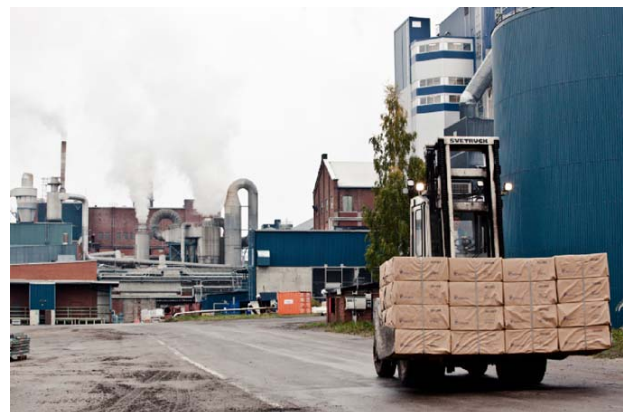
Pulp bales produced at Vallvik Mill.